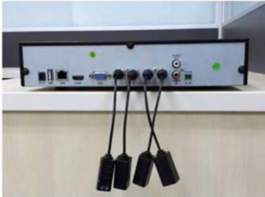
Old baluns make the cabinet a mess